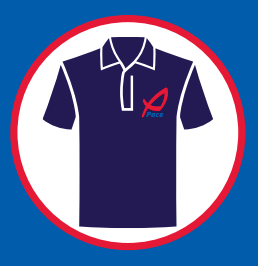
Modern uniform range